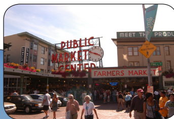
Pike Place Market