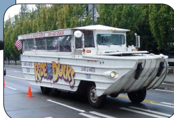
Ride the Duck Boats